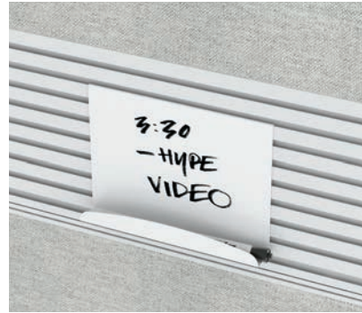
Dry-Erase Markerboard with Tray