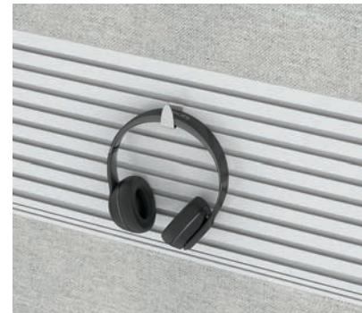
Ear Phone/Bud Holder