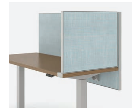
Side Privacy Screen