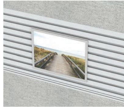
8x10 Picture Frame