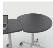
Nested Utility Table