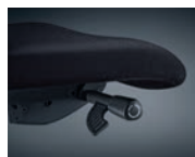
Seat Height Adjustment