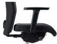
Optional Adjustable Lumbar Support