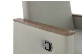
Wood Arm Cap