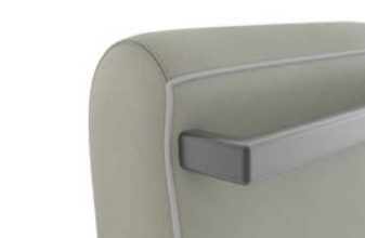
Bump Guard (protective welt cord)