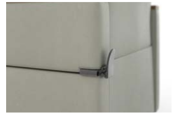
Drop Arm Release Lever