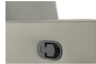
Back Release Lever