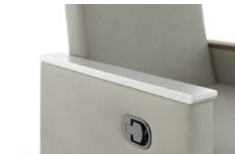
Solid Surface Arm Cap