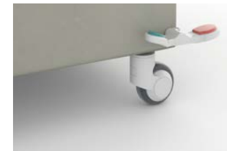
Central Locking Caster Paddle