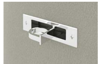
Utility Bag Hook