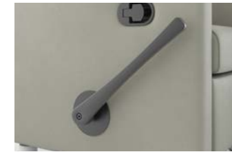
Footrest Release Lever