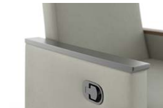
Polyurethane Arm Cap