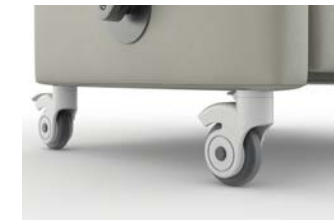
Individual Locking Caster