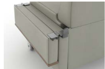
Drop Arm Released