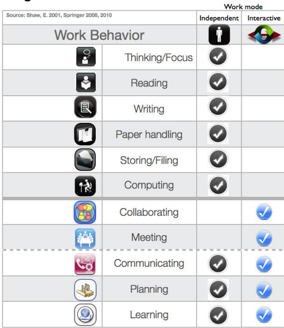
Figure 1. Work Modes and Work Behaviors 17