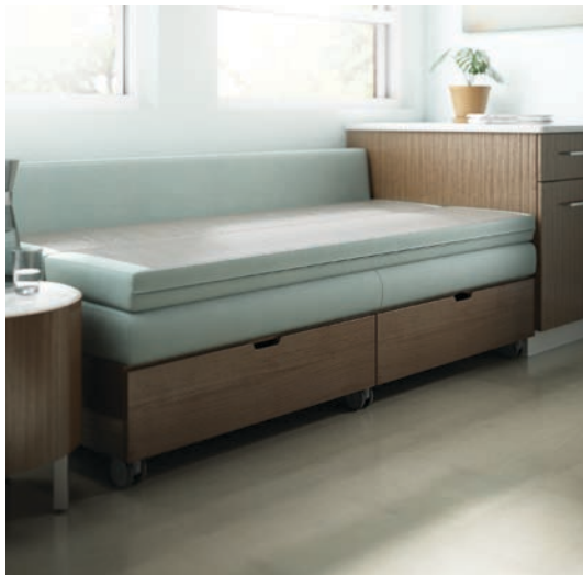
Fold Down Sleep Surface with Sure-Chek® Material