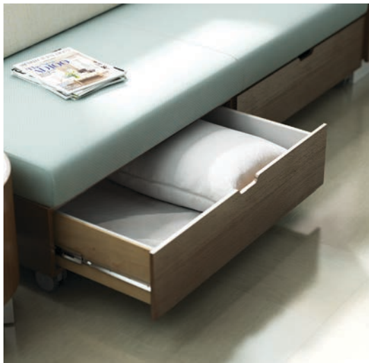
Optional Drawer Storage with Drawer Liner